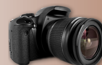
Photo Retakes are on Wednesday, November 8, 2023

Right Photography is scheduled for Monday, October 16th for student photos . All students must have their photo taken as our provincial registration process needs a current photo. Students will receive a proof of the photo and will be provided with options of a photo package that can be purchased. Cost and information regarding purchasing packages will follow once available.