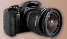
Photo Retakes are on Monday, October 28, 2024

Right Photography is scheduled for Wednesday, October 9th for student photos . All students must have their photo taken as our provincial registration process needs a current photo. Students will receive a proof of the photo and will be provided with options of a photo package that can be purchased. Cost and information regarding purchasing packages will follow once available.